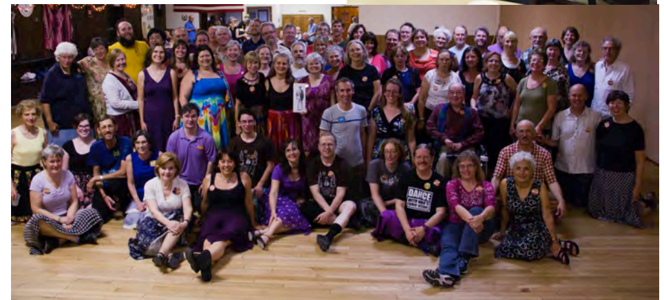
Participants at the SWROC, Sept 19 – 21, 2014 in Albuquerque, NM