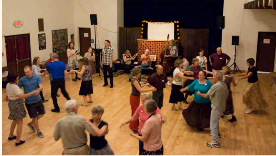
October Dance at the Great Arizona Puppet Theatre

Talent, dancers and organizers who want to be involved in this effort can e-mail swrocinfo@gmail.com . After November 15, you can also visit www.swroc.org for ongoing information and updates.