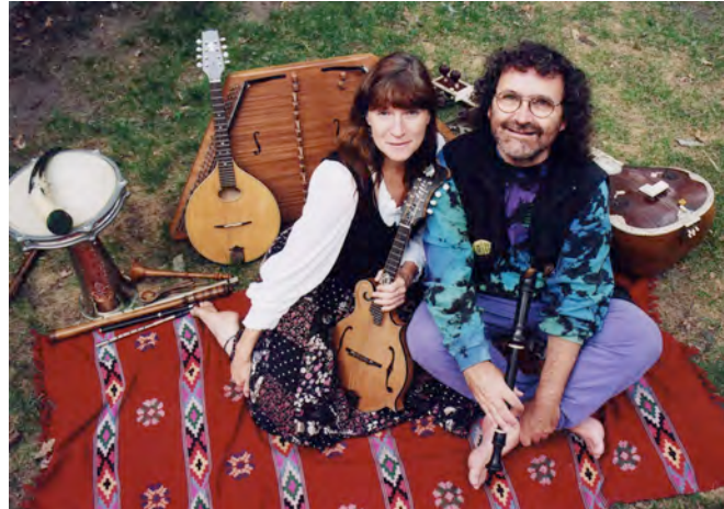
Four Shillings Short

The Flagstaff Folk Project featured artist is Four Shillings Short. Celtic, Folk & World music duo Four Shillings Short performs on a fantastic array of world instruments